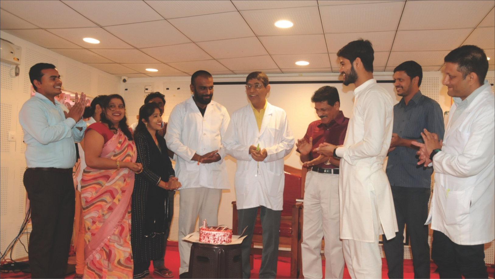
Team IAD celebrating the successful completion of training of Begusarai batch.